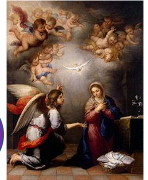
The Annunciation by Murillo