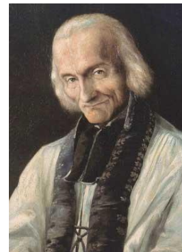
Saint John Vianney – Patron of Parish Priests