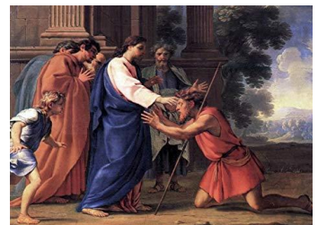
Christ Healing the Blind Man by Eustache Le Sueur