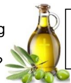
Olive oil for anointing