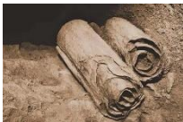
The Dead Sea Scrolls

When have you heard the Bible being read? How does it make you feel? What stories are passed on in your family and why?