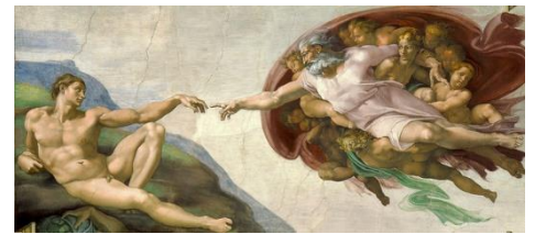
The Creation of Adam by Michelangelo