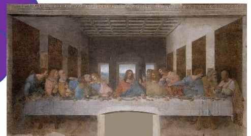
The Last Supper by Leonard Da Vinci